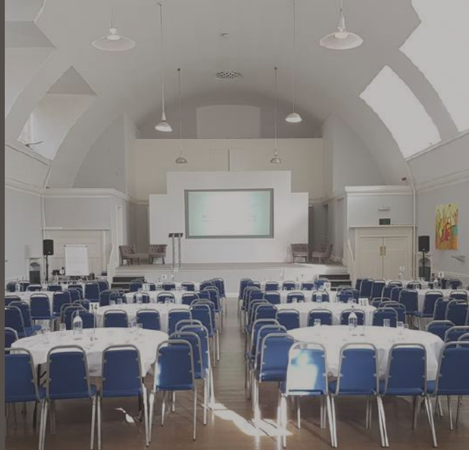
Mary Ward Hall

A central feature of Mary Ward House ever since its doors opened at the end of the 19th century, Mary Ward Hall is one of the most highly favoured and distinctive large conference rooms in London, offering an ideal space for AGMs, company training sessions, product launches, and corporate presentations.