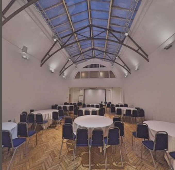
Brewer & Smith Room

Formally the gymnasium of the settlement, the Brewer & Smith is the second largest space within the venue and perhaps the most unique space. Delivering an exceptional level of natural light and spectacularly high ceilings, it's nestled within the lower ground floor of the building, creating a singularly quirky conference venue in London.